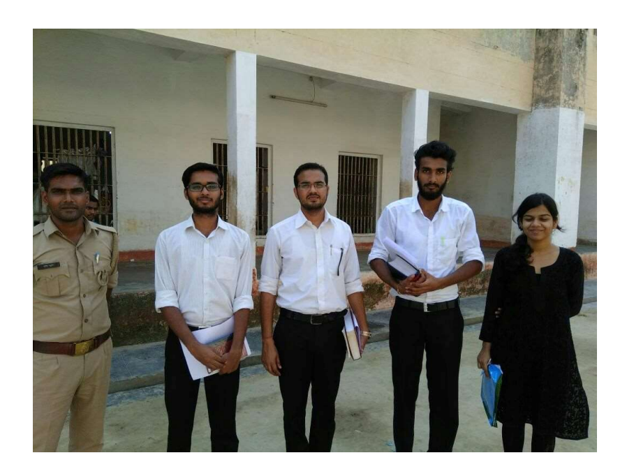
[Team of volunteers at the District Jail, Lucknow for the Prison Project]