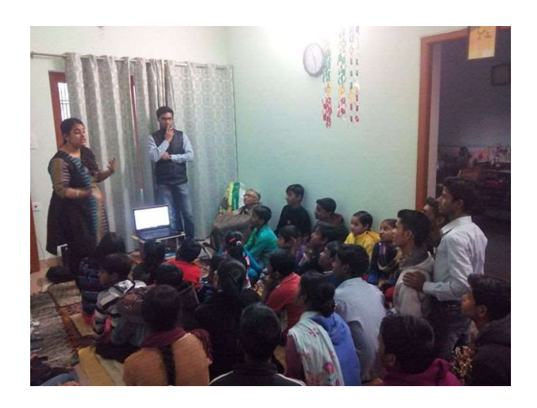
[Awareness session at Swatantra Talim]

The PLVs and members of Legal Aid Committee conducted an awareness session for the children of Swatantra Talim on 23rd August. The subject matter was CHILD LABOUR. The children were acquainted with the Law and were also made to talk to a representative of child line India Foundation, through a telephonic conversation on the 1098 helpline.