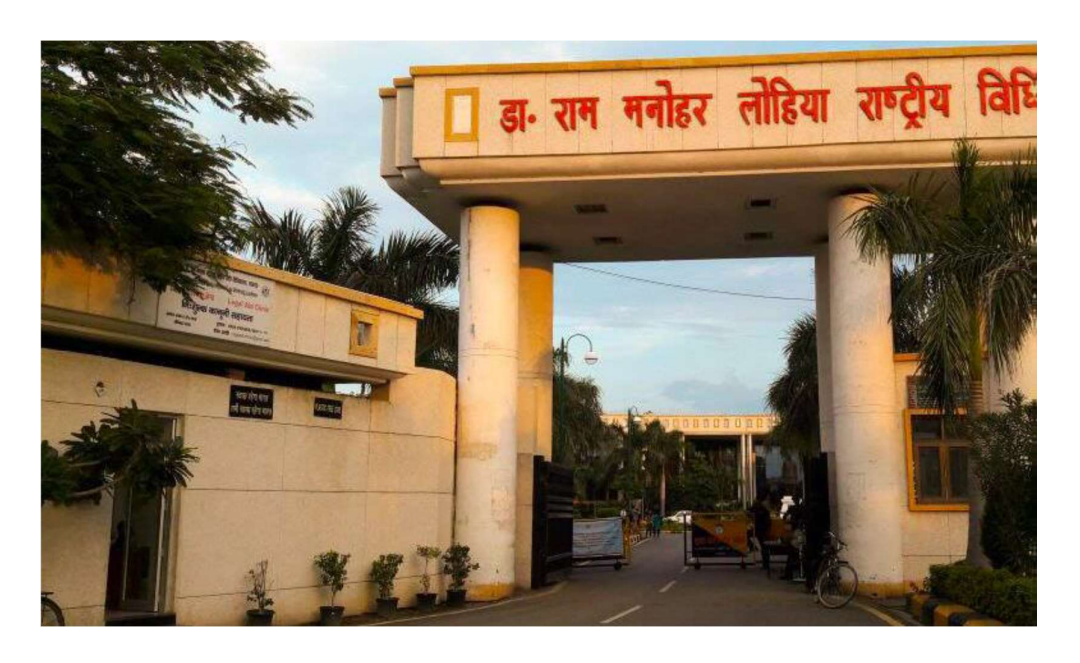
[Legal Aid Clinic on the left side of the main gate of the college]