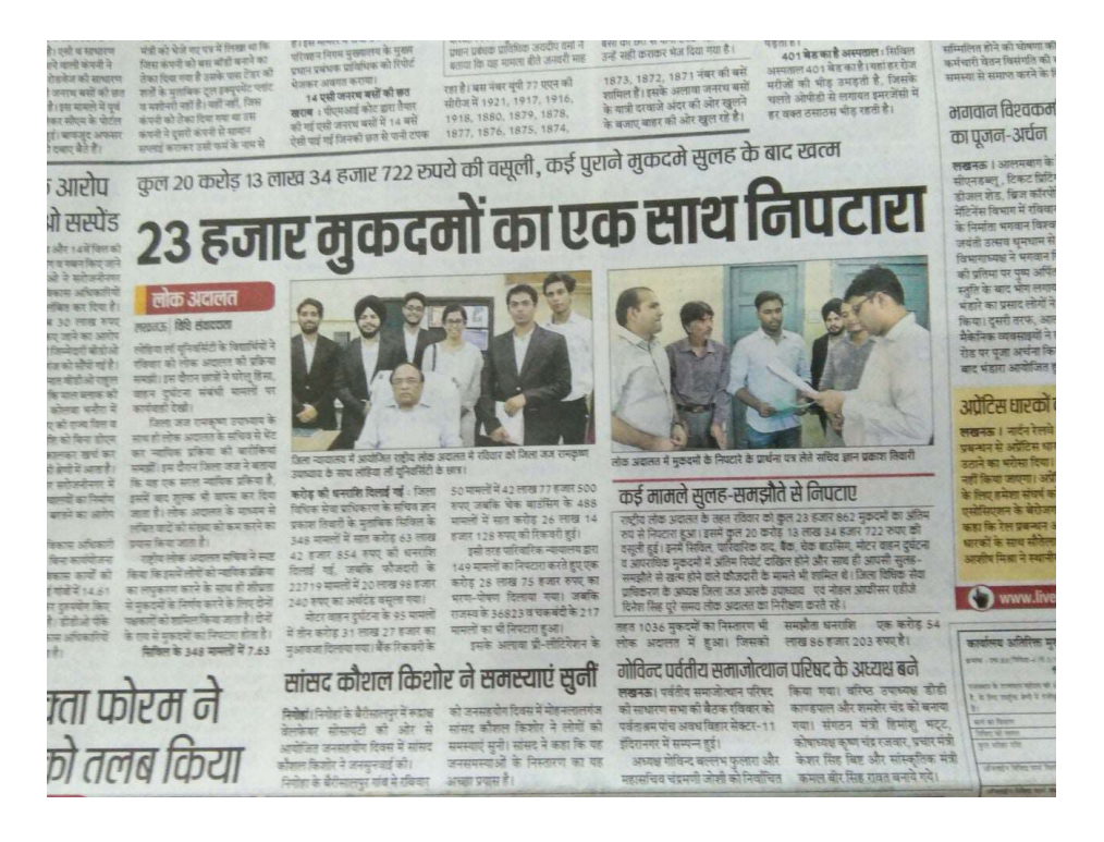
[Team of volunteers who were a part of the national Lok Adalat held at the Lucknow District court.]